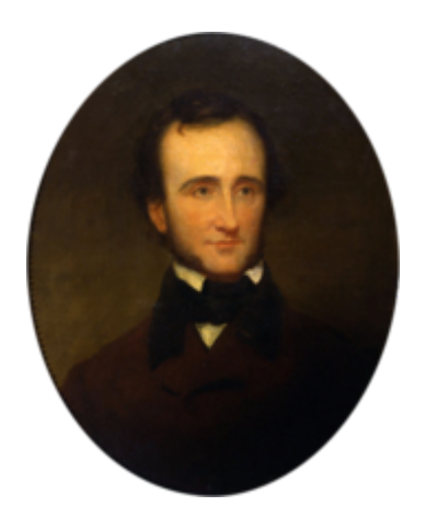
1845 portrait by Samuel Stillman Osgood

Beyond horror, Poe also wrote satires, humor tales, and hoaxes. For comic effect, he used irony and ludicrous extravagance, often in an attempt to liberate the reader from cultural conformity.<sup>[87]</sup> "Metzengerstein" is the first story that Poe is known to have published<sup>[95]</sup> and his first foray into horror, but it was originally