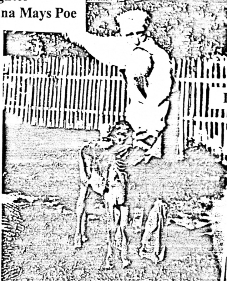
Issac Newton Mays