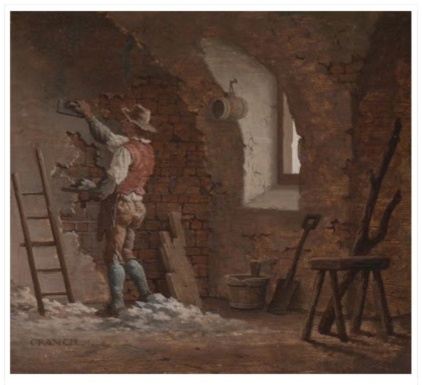
A nineteenth-century plasterer, via Wikipedia.