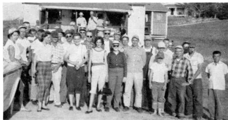
HERE IS A PART OF THE CROWD OF 86 fishing enthusiasts who registered for the Y-12 J Shift Fishing Rodeo held April 23 on Watts Bar Lake from White's Creek Dock.

Overseas companies affiliated with Union Carbide have spent over $100 million for new plant facilities in the last four years. The total will be at least $40 million this year. Major facilities scheduled to come into production are polyethylene and chemicals plants in Italy and India and a chemicals plant in England.