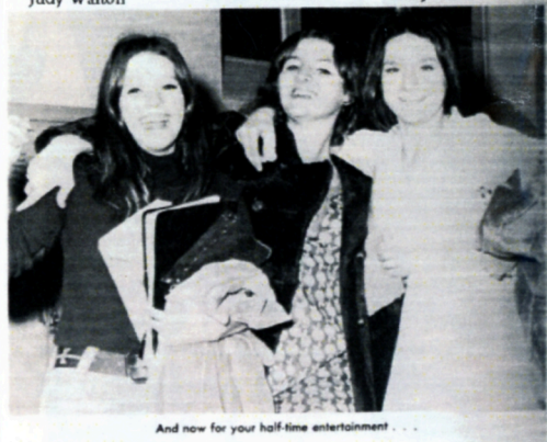
And now for your half-time entertainment . . .